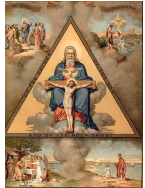
The Trinity: Peter Paul Rubens painting 1577-1640

The persons of the Trinity share a unique relationship which is unlike any other. Each person of the Trinity has their own traits and unique otherness; Father, Son and Holy Spirit. This is what makes it Trinity. If there were no otherness there would be no Trinity. The early Fathers of the church dared to describe the Trinity as a Divine circle dance, the Greek word used for this is perichoresis , this is the origin of our word choreography. I really like this description as it describes the love that flows from a never ending dance of loving relationship that we are all invited to join in. God is a God of relationship. All three persons of the Trinity co-exist in a never ending dance of love. This perfect relationship of Love is the model that the Church is invited to imitate. As a Christian community we are invited into a loving relationship and we in turn are asked to invite others into this loving relationship. So let's dance!