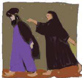
The persistent Widow - Pray without ceasing.