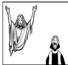
The people were amazed because Jesus taught them as one who had _____.