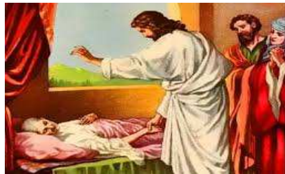
Jesus heals Simon's Mother-in-law.

IMPORTANT: there will be No EVENING MASS this Tuesday night, 6 th February.