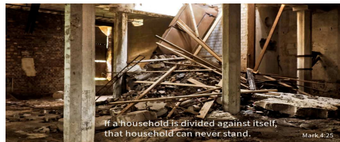
If a household is divided against itself, that household can never stand. Mark 4:25