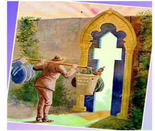
Try to enter by the Narrow Gate

We ask this through Christ our Lord. Amen.