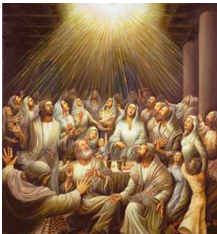
As the Father sent me, so I am sending You.